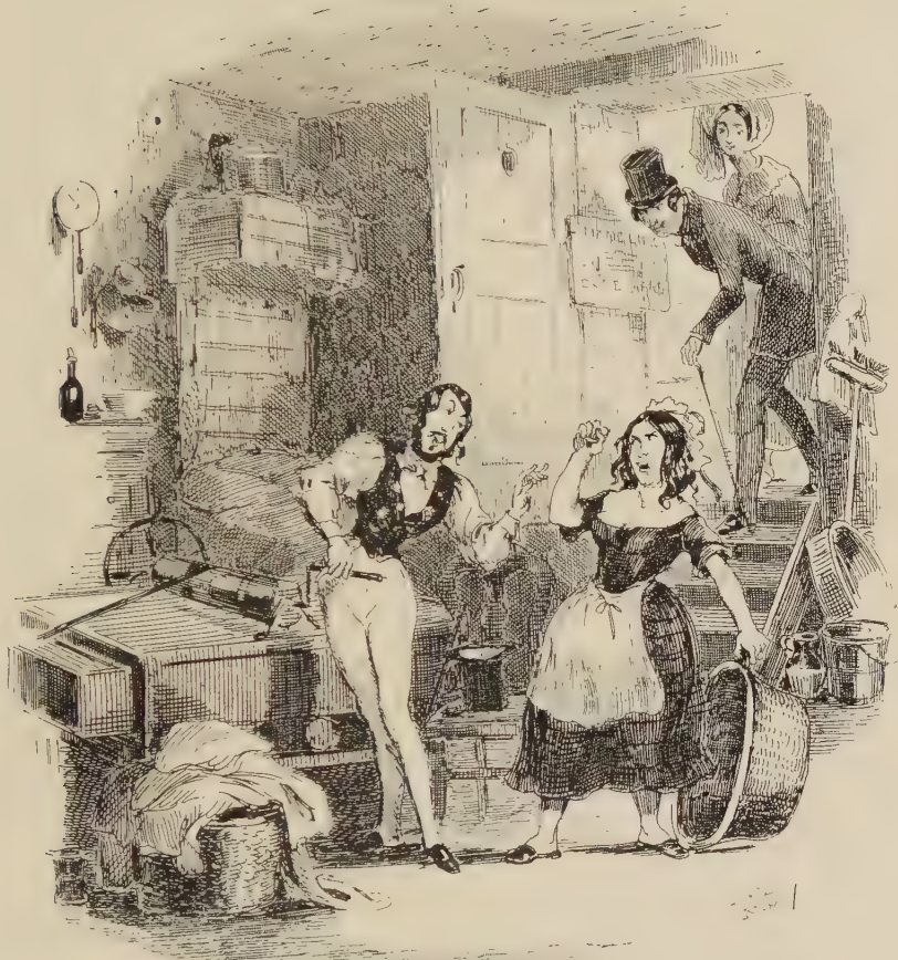
REDUCED CIRCUMSTANCES OF MR. MANTALINI.